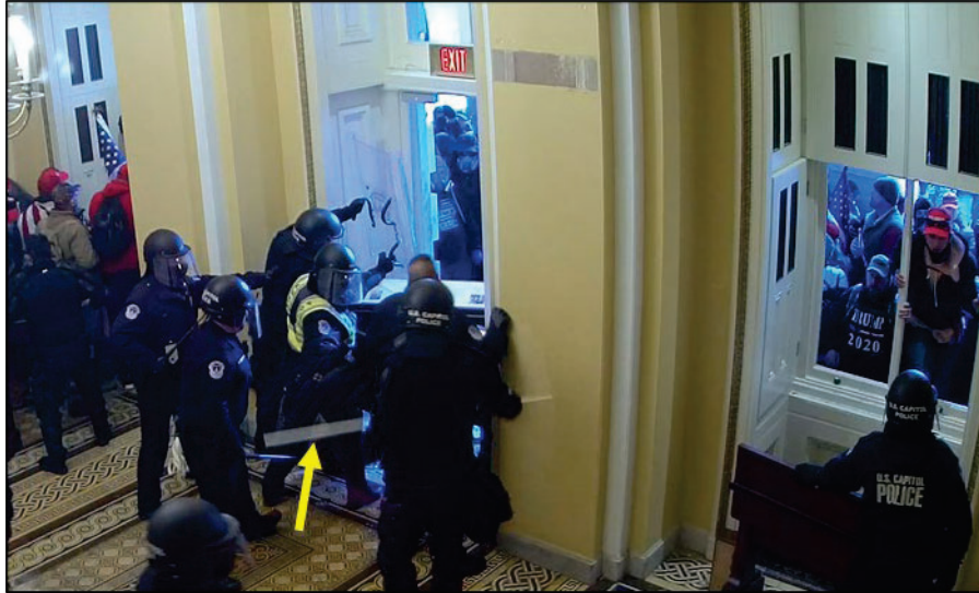
PVC pipe after it is thrown at officers through open door

25. Less than 30 seconds after the altercation during which Officer 1 pulled AYALA's flag into the Building, the Senate Wing door was breached by rioters and pulled open. Within seconds of rioters opening the door, a PVC pipe with no flag attached was thrown through the open door striking at least one officer. AYALA appeared to depart the area immediately outside the Senate Wing Door at approximately 2:45pm.