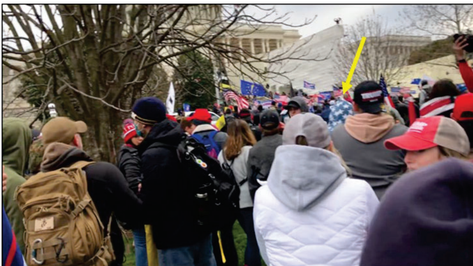
AYALA running forward through crowd after police line breaks

18. In a video posted to Parler on or shortly after January 6, 2021, AYALA is depicted climbing police barriers, which were moved by rioters to access to the Upper West Terrace. According to the ProPublica site dedicated to the Capitol Riot, the footage was taken at approximately 2:16 p.m.